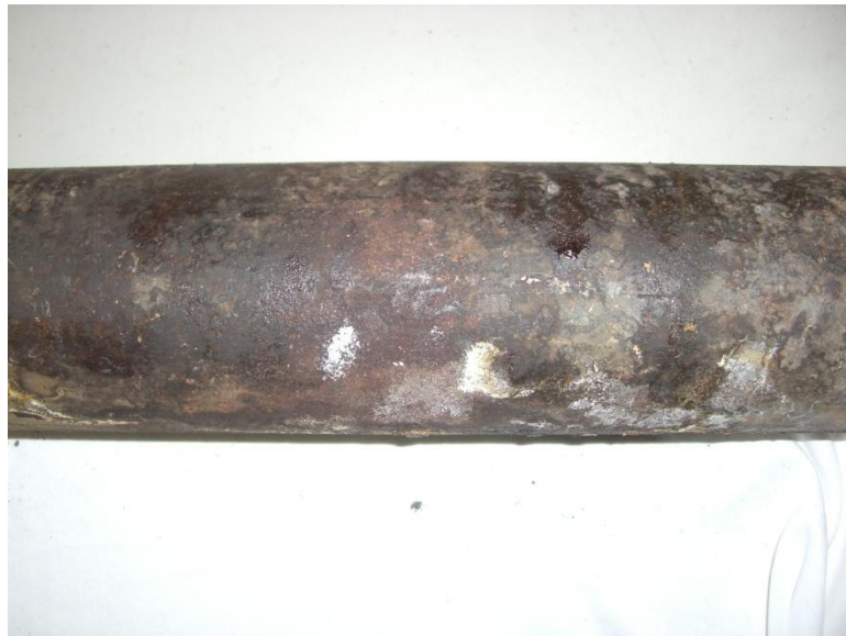
IAS proving coupon supplied by contractor before chemical clean