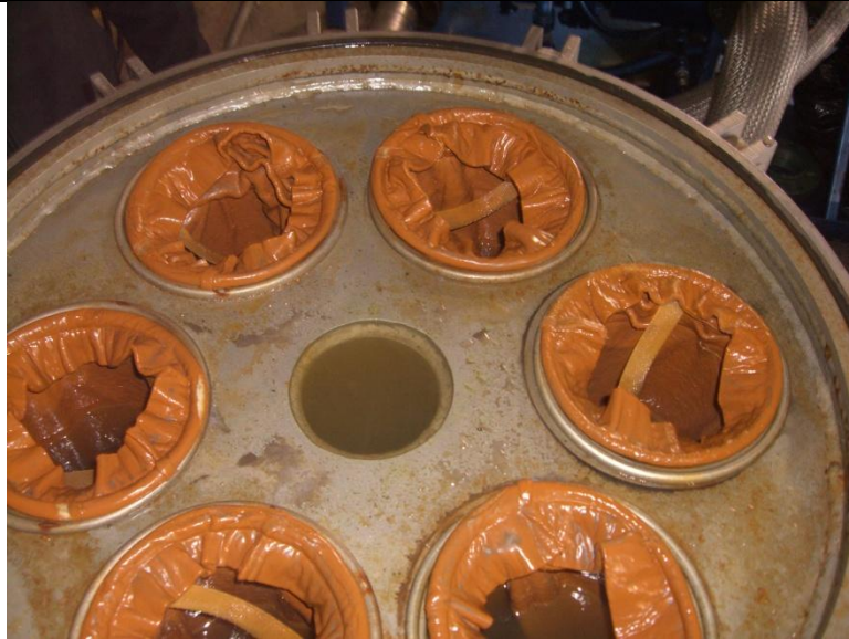
IAS decontaminates the HRSG's during the chemical cleaning process