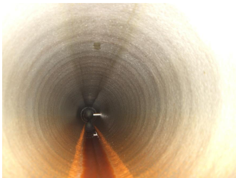
Internal of the HRSG return line after chemical cleaning