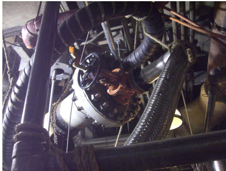
IAS bypasses the condenser (Supply line to Condenser)