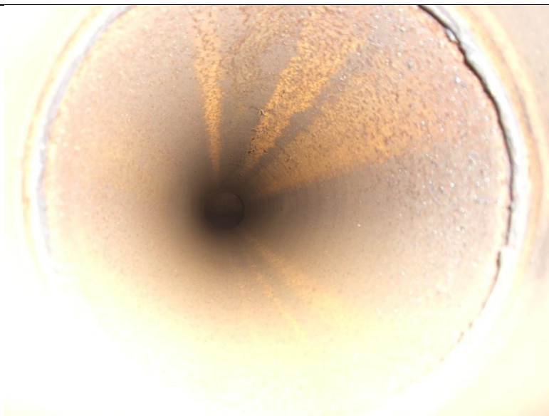
Internal of the HRSG return line before chemical cleaning