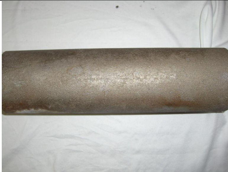
IAS proving coupon after chemical clean